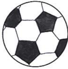
a soccer ball