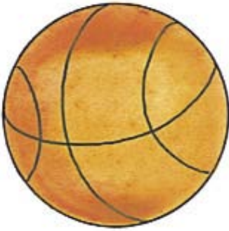
Basketball (a basketball)